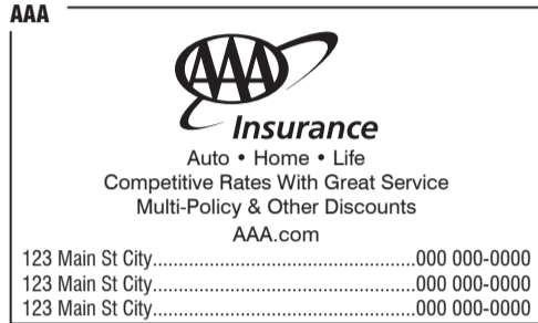
3HSA 15 x 9 picas