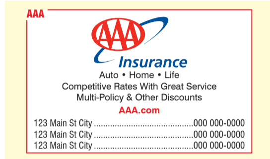
3HSU 14p2 x 9 picas