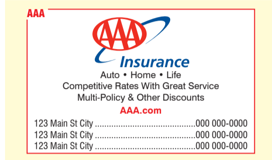
3HSU 14p2 x 9 picas