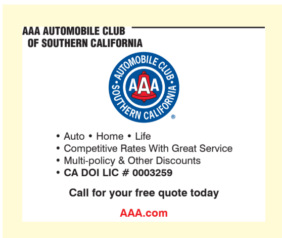
CTMWP 15 x 12 picas