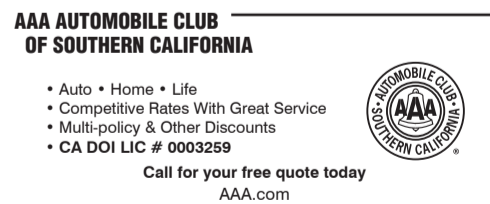
TM 15 x 6 picas