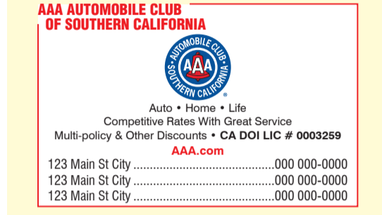
3HSU 14p2 x 9 picas